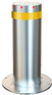
SP BLD HY