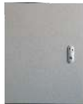
Hydraulic Bollard Controller