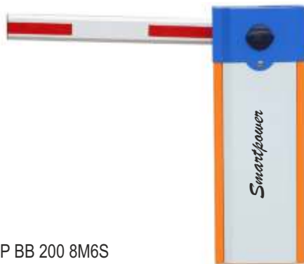
SP BB 200 8M6S

For Residential, Commercial & Industrial purpose SP BB 200 series