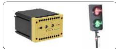
Loop Detector ( Double)