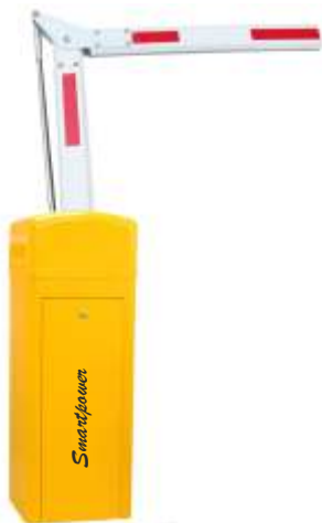
SP BB 200 FOLDING