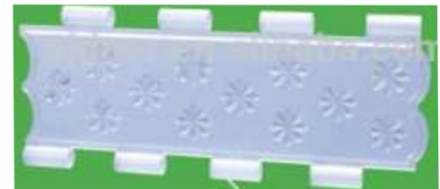
Semi Transparent Slats