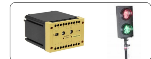
Loop Detector ( Double)