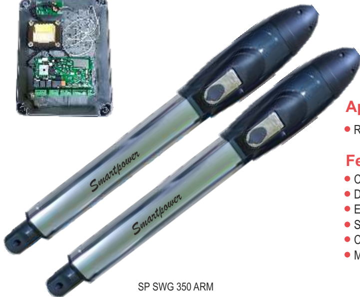
SP SWG 350 ARM