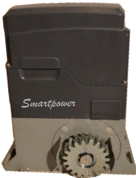
SP SLG 2500B ML

For Residential, Commercial & Industrial Gates SP SLG series (300 ~ 4000 Kg Gates)