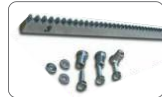
MS Gear Rack (1 Meter) with Bolts