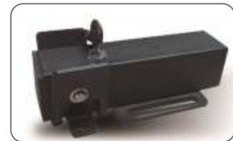
Swing Gate Motorized Lock