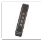
Wireless Push Switch