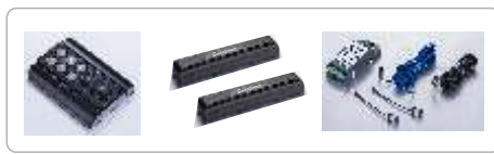
6 Key Remote Switch Motion Sensors X 2 nos Photo Safety Sensors