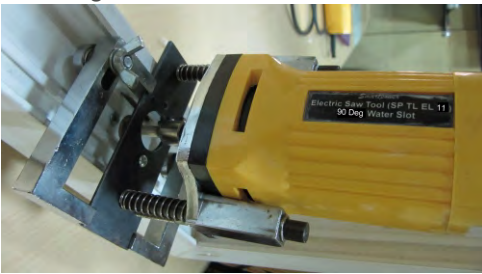
90 Deg Water Slot Model SP TL EL 11

Product Description Smartpower ® Electric Cleaning Tools are widely used in uPVC Door & Window manufacturing process. These tools are portable in size and weight and can easily be carried at site.