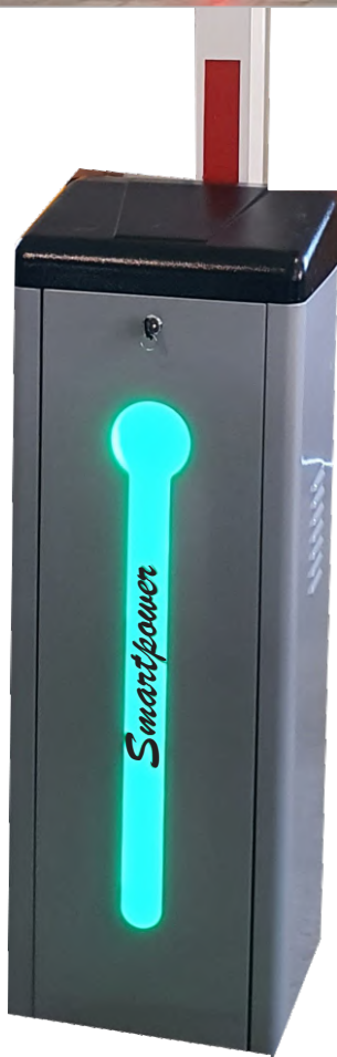
SP BB 400 6M4S LED

For Residential & Commercial purpose SP BB 400 (6 Meter 4 Sec)