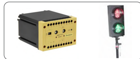
Loop Detector ( Double)