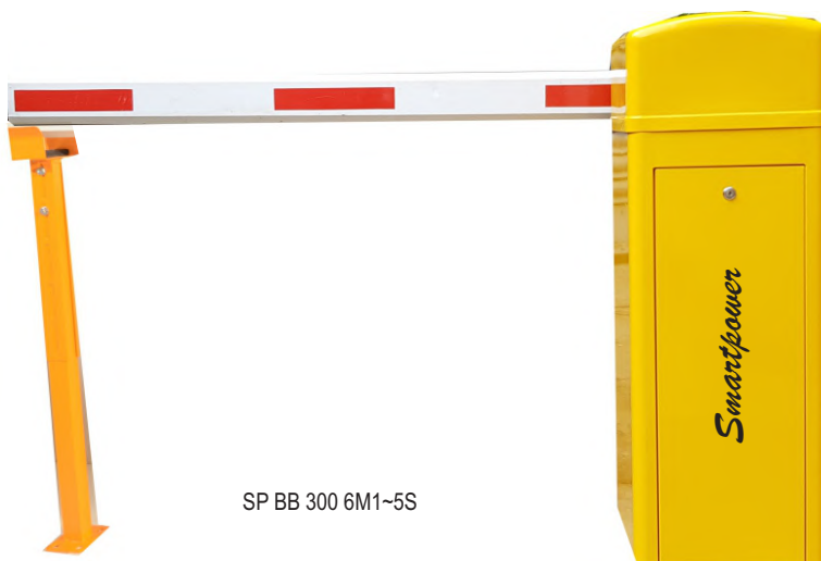
SP BB 300 6M1-5S