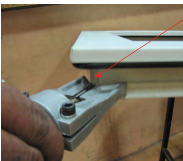
Outer Angle Pneumatic Cleaning Tool Model SP TL PN 01